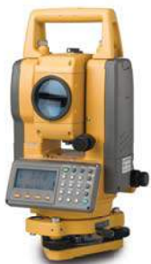
GTS-100N Series Construction Total Stations